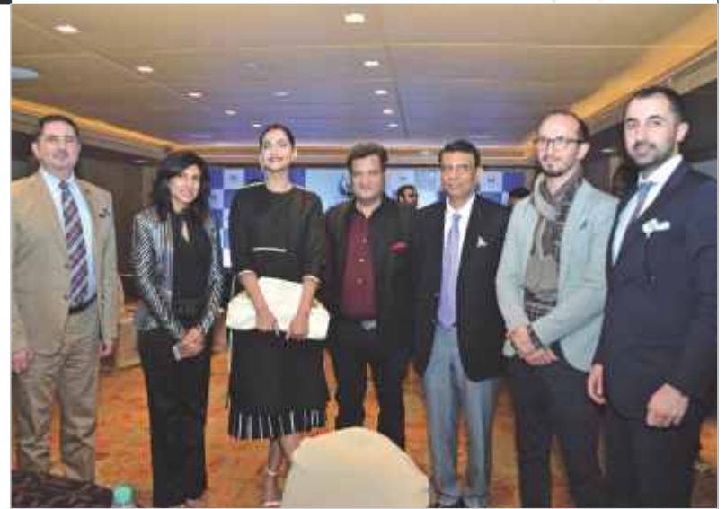
▼ Invitees enjoying the gala evening