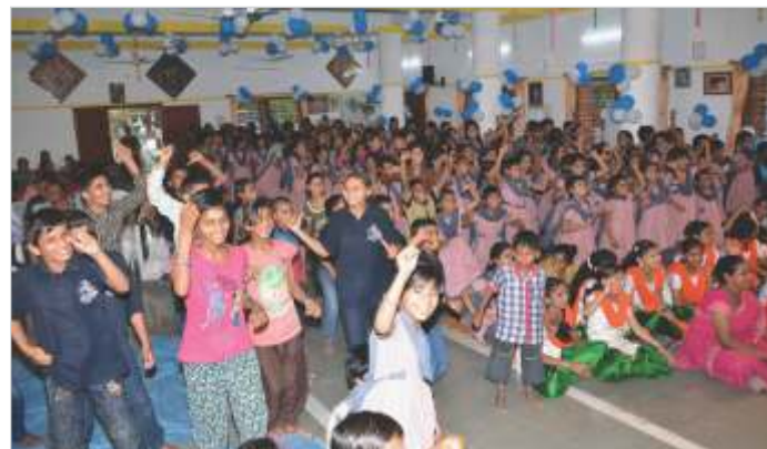
▲ Students of Manthan