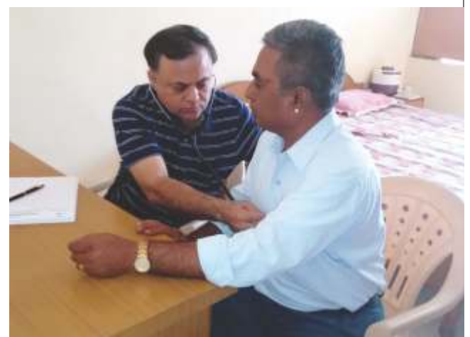
▲ Medical check-up organised by CERA

The CERA Foundation, in association with Rotary Foundation, built two classrooms for a Computer Laboratory and a Science Laboratory for the school in Karoli Gam. CERA also contributed to the building of sanitation facilities at schools in seven locations including Sarsav, Ankhol, Visatpura, Dhoria and Acharasan.