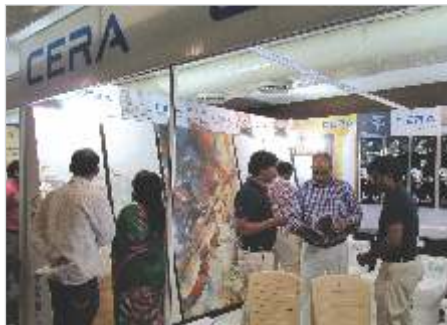
▲ A view of the CERA Stall at CREDAI Exhibition, Vijayawada

CERA participated in the CREDAI Exhibition, Vijayawada, that was held at the Convention Centre. The products were well appreciated by the visitors.