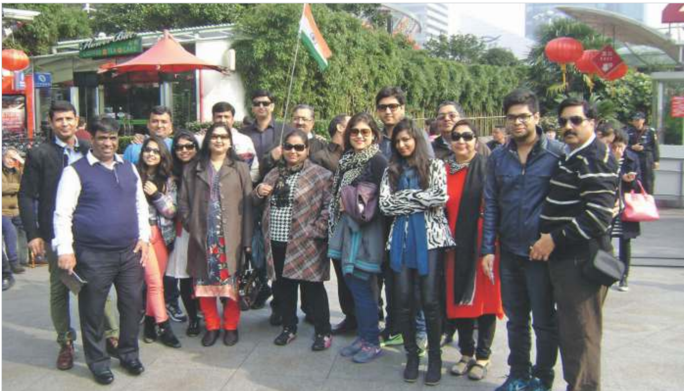
▲ Delhi dealers during their trip to China