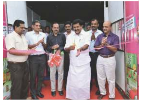
▲ Shri V.S. Sivakumar, Minister for Health, Family Welfare and Devaswom, Government of Kerala inaugurating the Vanitha Veedu Exhibition, Thiruvananthapuram