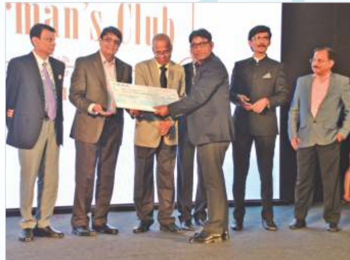
Team Uttar Pradesh & Uttarakhand