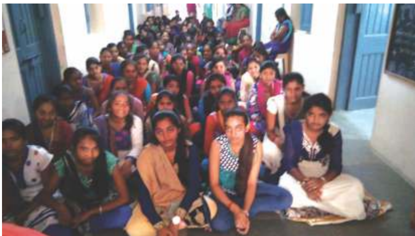
▲ Students at the pre examination get together organised by CERA Foundation

The meaning of true progress goes far beyond its financial aspects. CERA believes that progress also incorporates the responsibilities of the company towards the community as well as the actions it takes for the welfare of the community. CERA is involved in various social welfare activities and has always considered social contribution to be a moral duty.