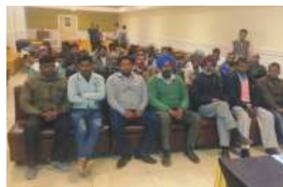
▲ Mason meet at Patiala