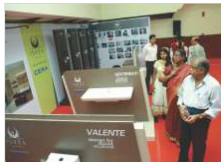
▲ Seen above are visitors taking a close look at the ISVEA products

The Habitat Conclave 2016 was held at AES Ground, Ahmedabad. CERA was the Silver Sponsor of this prestigious event.