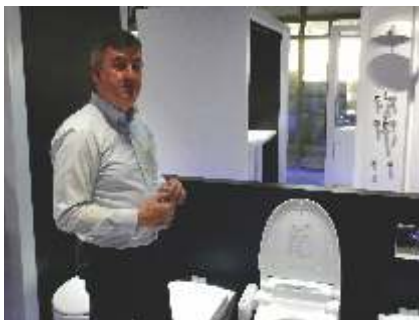
◀ An invitee looking at the wide range of CERA products