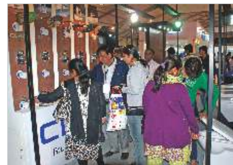
▶ A view of the CERA stall at CREDAI Gujcon, Ahmedabad

CERA participated in CREDAI Gujcon which is a premium platform for showcasing its products to different types of audiences.