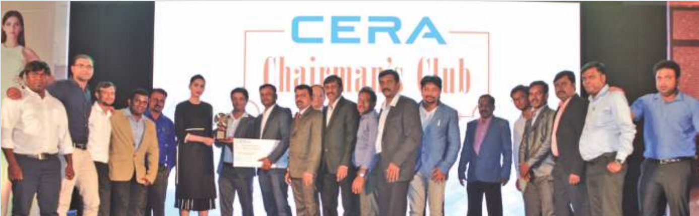
Team Upper North