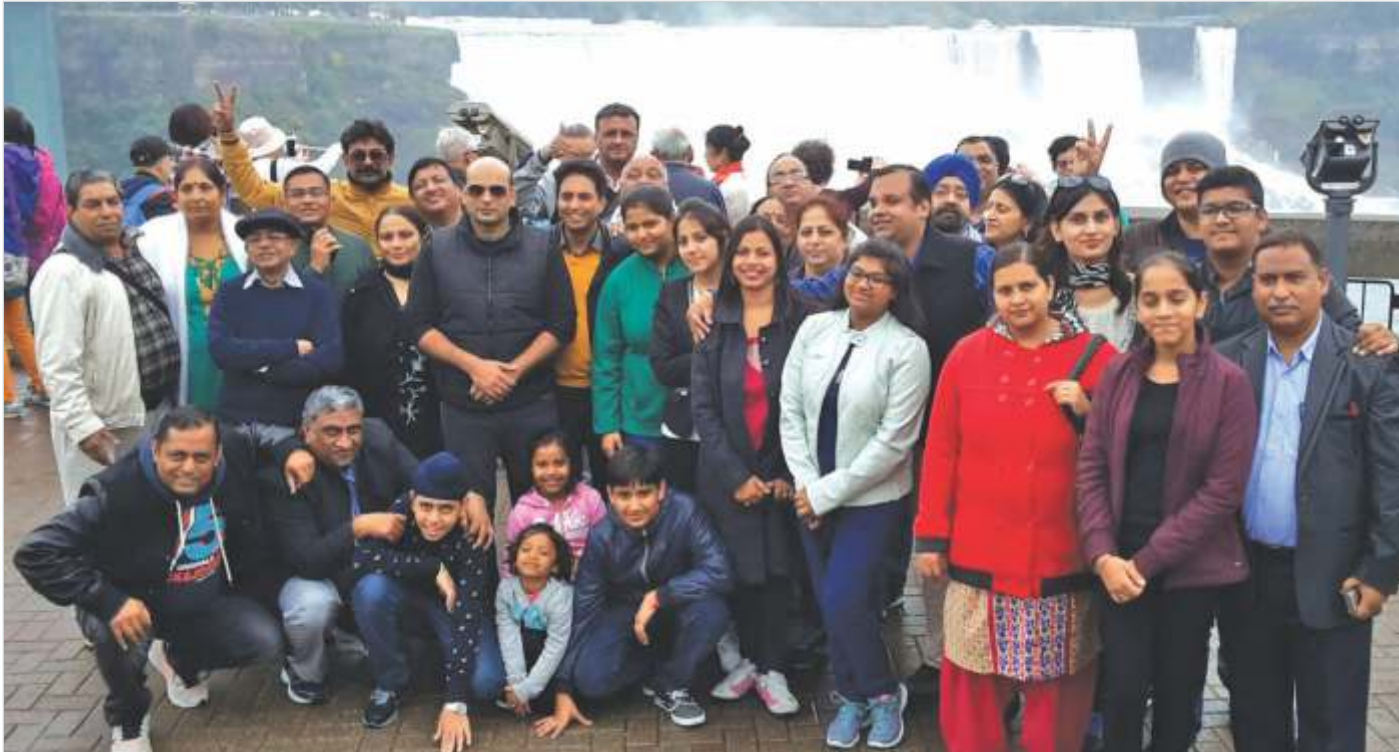
▲ Upper North and Uttar Pradesh dealers striking a pose in front of Niagara Falls, Canada

Our best performing dealers, whose efforts help CERA achieve remarkable success, are rewarded with trips to foreign destinations.