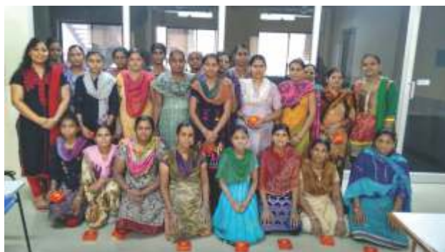
▲ Women employees of CERA Kadi celebrating International Women's Day

CERA believes in gender equality and has sizeable number of women employees.