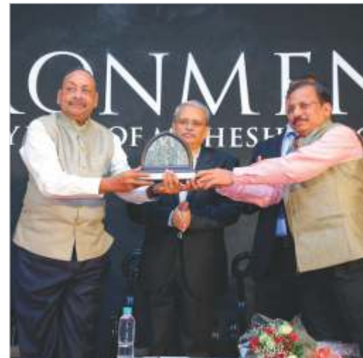
▼ Hon'ble Chief Minister of Kerala Mr. Oommen Chandy at the Mvironments event