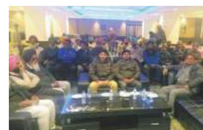
▲ Mason meet at Barnala